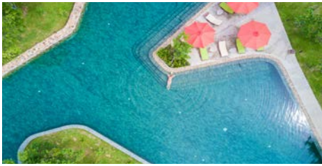
The Main Pool

Holding one thousand cubic meters of water, Templantation's pool is one of the largest in Siem Reap.