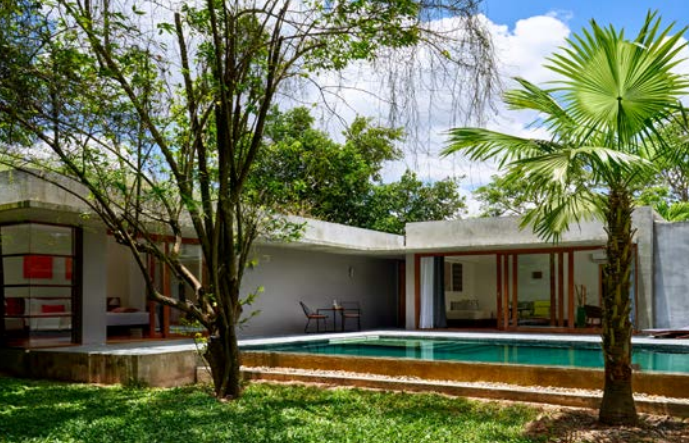
PRIVATE POOL SUITE (70 sqm*)