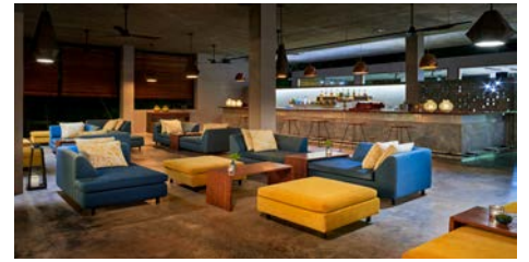
The Lounge & Bar

Asian & Khmer cuisine are offered alongside Western classics right by the pool.