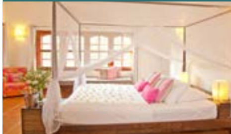
SUPERIOR DOUBLE ROOM (20 - 30 sqm*)