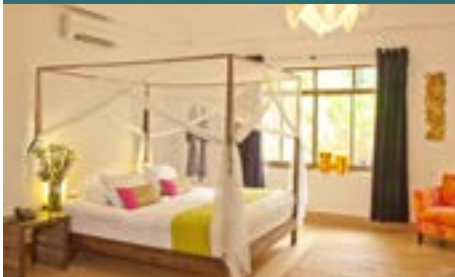
STUDIO (23 - 55 sqm*)