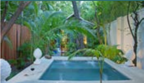
JACUZZI BUNGALOW (25 sqm*)