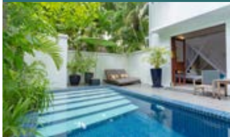
PRIVATE POOL ROOM (20 sqm*)