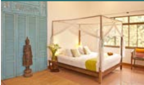
SUITE (90 - 120 sqm*)