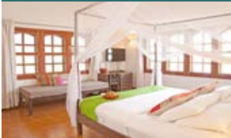
DELUXE DOUBLE ROOM (28 - 32 sqm*)