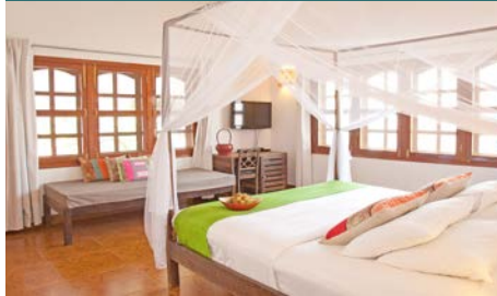
DELUXE DOUBLE ROOM (28 - 32 sqm*)