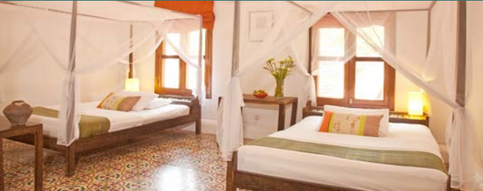
TWIN ROOM (20 - 30 sqm)