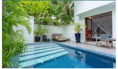
PRIVATE POOL ROOM (20 sqm*)