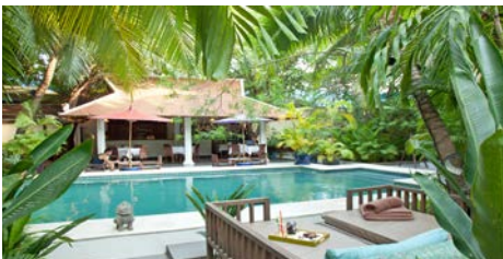
The Lush Pool

Shaded by trees, the Lush Pool provides a cool and tranquil environment.