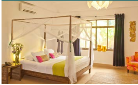
STUDIO (23 - 55 sqm*)