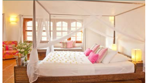
SUPERIOR DOUBLE ROOM (20 - 30 sqm*)