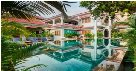
The Sun Pool

Shaded by trees, the Lush Pool provides a cool and tranquil environment.