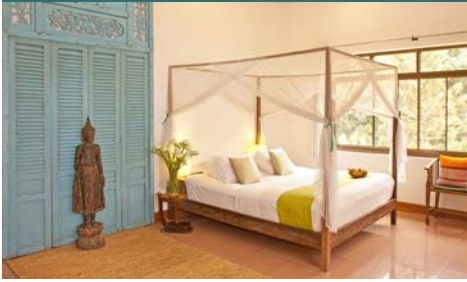
SUITE (90 - 120 sqm*)