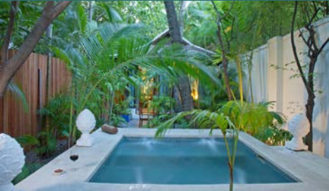
JACUZZI BUNGALOW ROOM (25 sqm*)