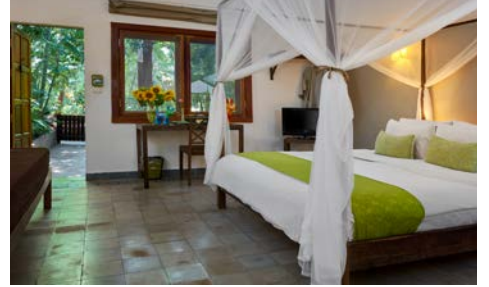
SUPERIOR FAMILY ROOM (35 sqm*)