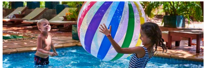
The Paddling Pool

The shaded pool is surrounded by cabanas and loungers.