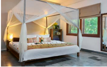
DELUXE DOUBLE ROOM (35 sqm*)