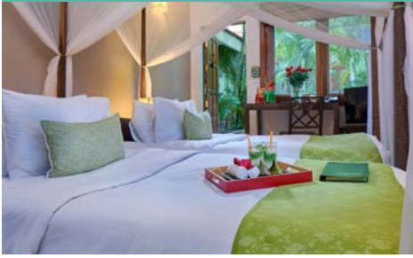
STANDARD TWIN ROOM (20 sqm*)