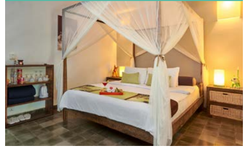
STANDARD DOUBLE ROOM (20 sqm*)