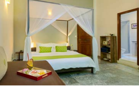
SUPERIOR DOUBLE ROOM (35 sqm*)