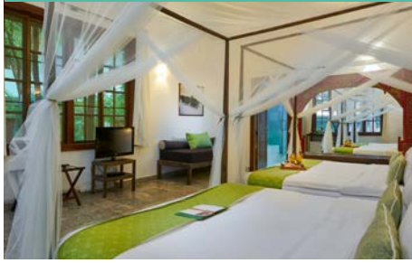
DELUXE TWIN ROOM (40 sqm*)